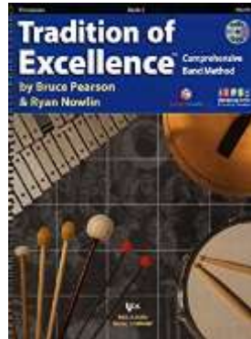
7 th Grade Blue